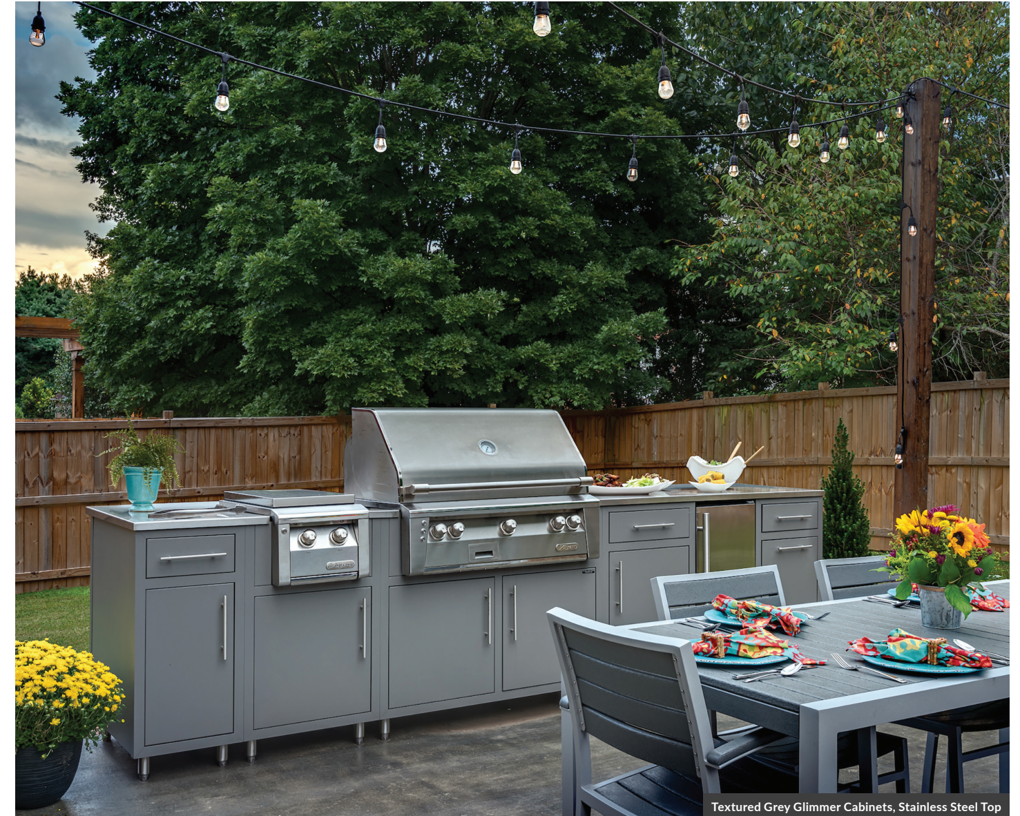
Textured Grey Glimmer Cabinets, Stainless Steel Top