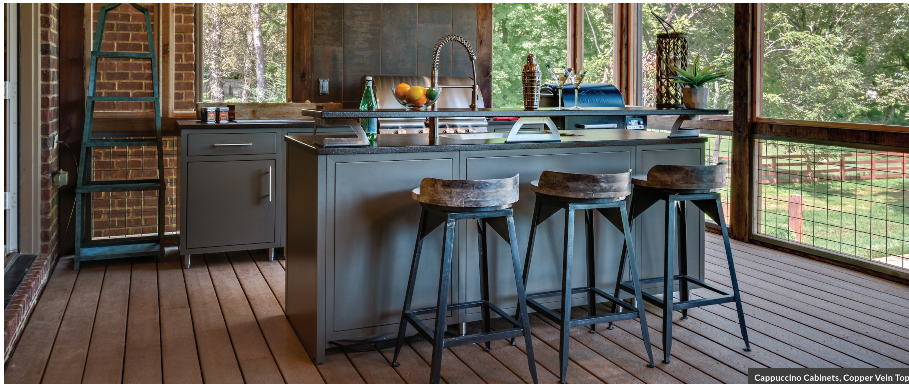
Cappuccino Cabinets, Copper Vein Top