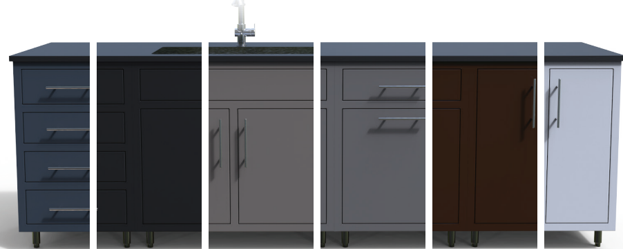
Anthracite Textured Black Cappuccino Textured Grey Glimmer Speckled Walnut Textured White

We offer widths from 12" to 66". Cabinet options include drawer bases, door and drawer bases, sink bases, bar seating, and more.