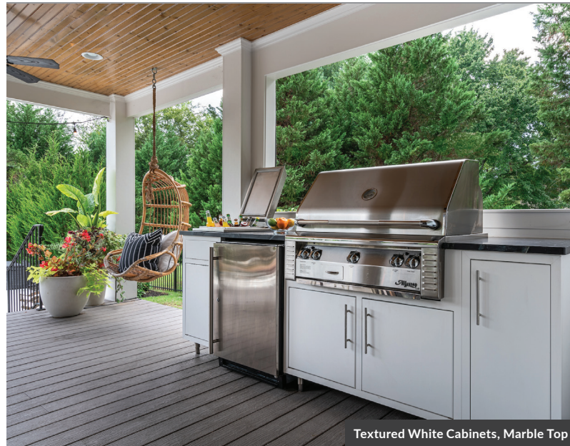
Textured White Cabinets, Marble Top

Our durable powder-coated drawers are easy to clean and provide a great place to store grilling tools year-round. All cabinets have finished back panels, and finished side panels (when specified) at no additional cost.