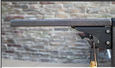
Flip-Up* or Stationary Counter

Available on Torch 48, 54, 76. *Flip-up requires factory install.