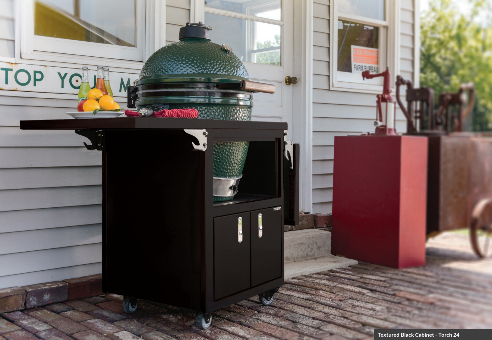
Textured Black Cabinet - Torch 24