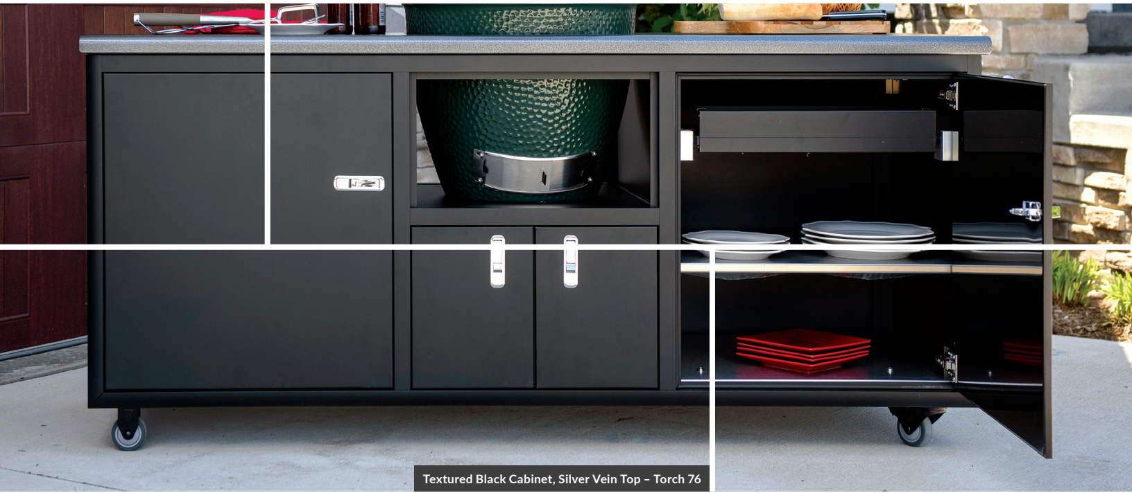
Textured Black Cabinet, Silver Vein Top - Torch 76