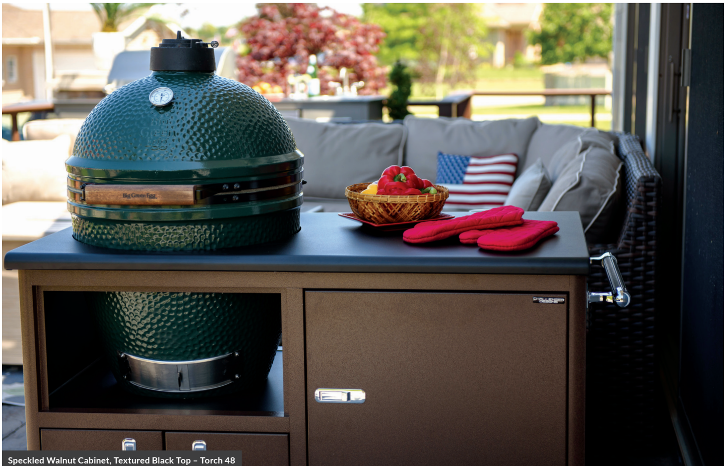
Speckled Walnut Cabinet, Textured Black Top – Torch 48