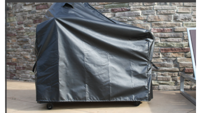
Aqualon (Marine Grade) Cover