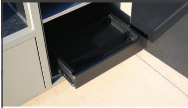
Universal Floor-Mount Drawer

Available on all Torch models. (16"W x 21"D)