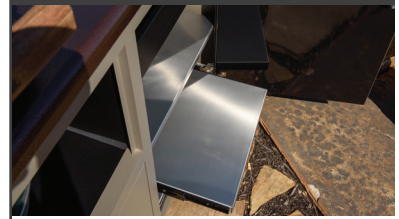
Universal Floor-Mount Slide-Out Shelf Available in two depths.

Available on all Torch models. (16"W x 21"D)